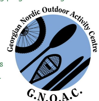
Georgian Nordic Paddling

"The focus is on teaching marathon canoe racing and this primarily involves boathandling skills at a higher level than is required for recreational canoeing or tripping, although, of course, these skills are very useful for non-competitive canoeing. Marathon canoeing is a style of paddling as much as a competitive discipline. The focus is on efficient boat control and efficient stroke mechanics. The techniques are applicable to any canoeing, from racing or tripping in recreational canoes or racing canoes."